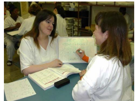
Unity City Peer Educator and Student

Volunteers knowledgeable in city government came to Dawson to help the women learn how to campaign to elect their own mayor, city council members, review board, resolution committee, and city manager. Following the election, the women formed committees so that everyone would be an active participating member. The 54 residents in Dorm 10A held their first election in 2004 and voted to name the city Unity . The Dorm is divided into three neighborhoods and nine families, with names being voted on for each. Permission was granted for the women to paint their walls with pictures that depict HOPE. Unity City has enabled HOPE to implement the educational component in an effective manner. The women are motivated by the potential for growth within this innovative concept. Warden Keeton says it is the best dorm on the unit. Unity City's first mayor is now in college, majoring in psychology. Another former Unity City student is also in college and has a 3.0 grade average. Previously incarcerated HOPE inmates are encouraged to maintain contact following their release.